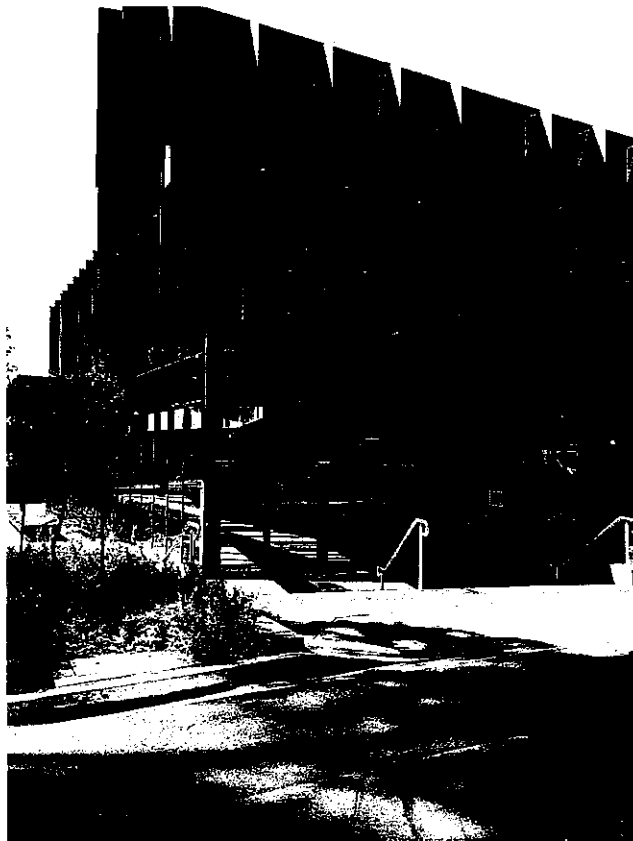
Main Entrance for Patrons