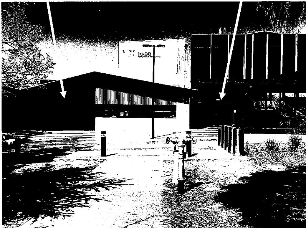
Student Drop Off & Pick Up